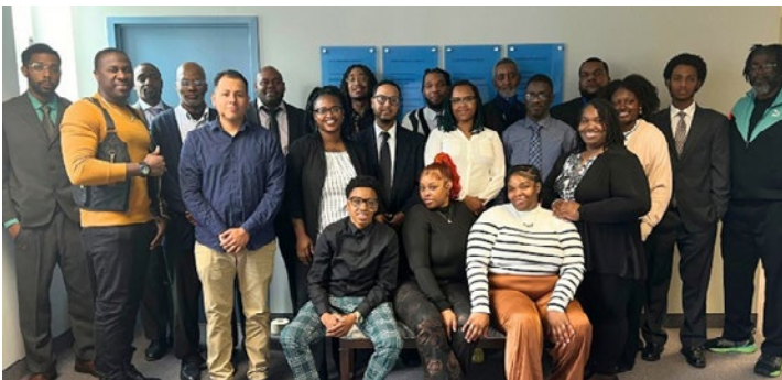
Our April 2024 Commercial Transportation Careers graduates are now ready to earn their CDL-B driver's licenses and accelerate toward their new careers.