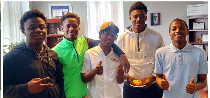
Motivated young adults earning industry certification, making unexpected friendships, and paving the way to a brighter future!

The first half of 2024 has been extremely busy at Maryland New Directions! Since January 1, we have hosted six cohorts in our three main career training programs—Professional Skills Training; Maritime, Transportation, Distribution & Logistics; and Commercial Transportation Careers. So far in 2024, a total of 137 clients have completed these courses with industry-specific skills and credentials to prepare them for their next careers. In addition, another 22 clients have received one-on-one services through our partnerships with the House of Ruth and the Ticket to Work program.