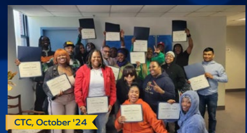
CTC, October '24