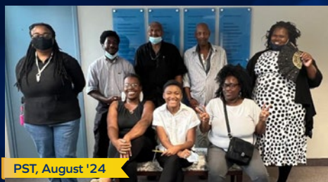
PST, August '24