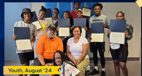
Youth, August '24