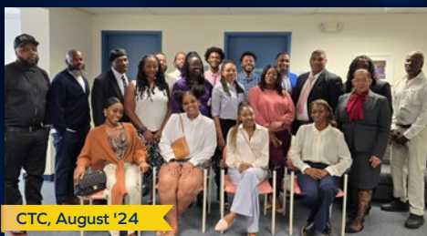
CTC, August '24

These are just a few of the cohorts who have completed our training programs in the past few months. Congratulations to these individuals on taking this important first step towards their new careers!