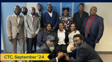
CTC, September '24