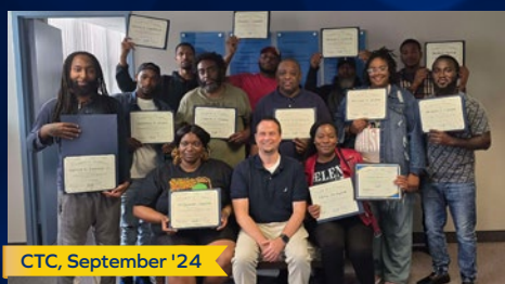
CTC, September '24